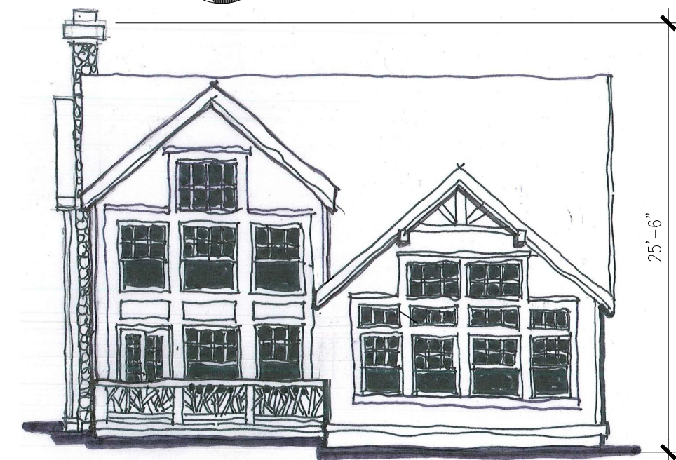
(MAIN HOUSE — PHASE II) Baker/Mott Residence