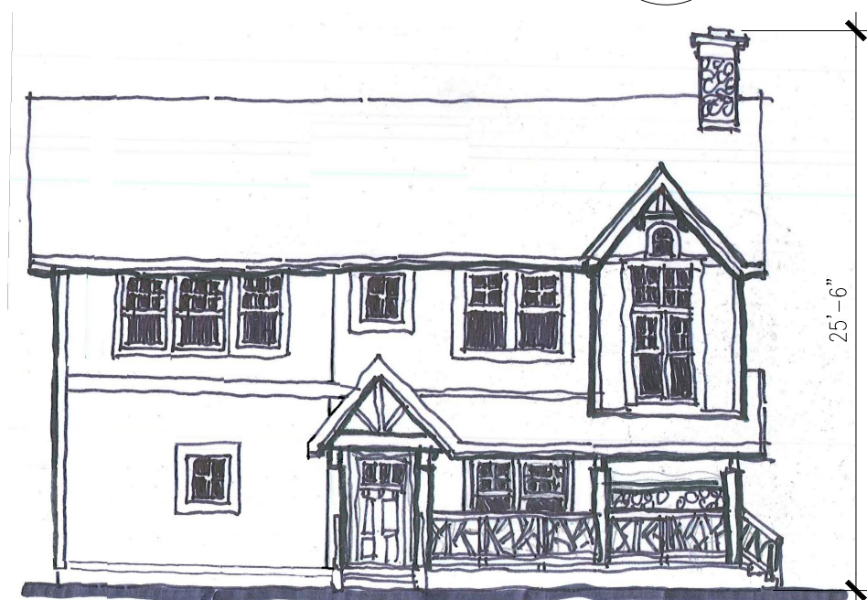
(MAIN HOUSE — PHASE II) Baker/Mott Residence