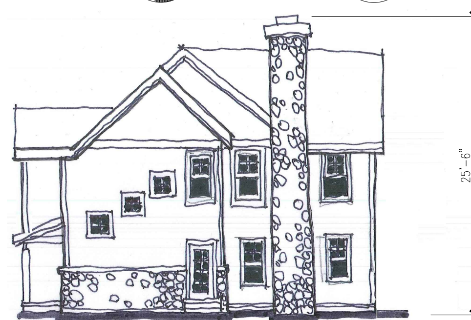
(MAIN HOUSE — PHASE II) Baker/Mott Residence